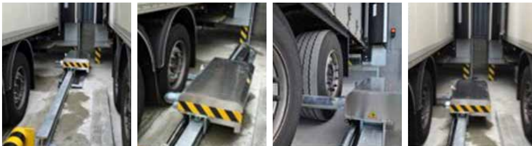
Waiting for truck